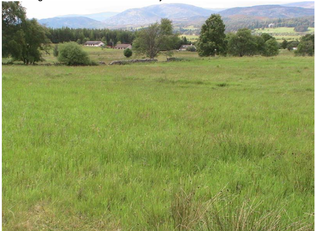
Fig 2 photograph from east corner of site showing dry-stane dyke that bisects the site with village in background

1. The site lies on the south side of the village of Insh between the village and an area of woodland (Inshriach Forest). There is existing development to the northern boundary and the site that is accessed from a lane that serves six existing houses from the B970. The site itself is largely open and slopes down from the forest edge to the village. There are a few scattered trees on the site. There is also a dry stane dyke that bisects the site in half and a footpath from the village into the woodland area to the east follows the line of this dyke. This path links in with the Badenoch Way which runs through the forest along the south eastern boundary of the site.